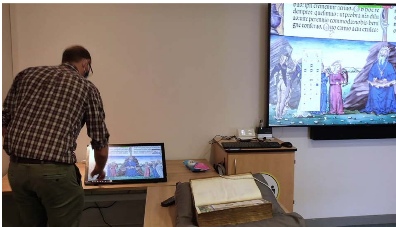
A touchscreen control panel enables easy controlling of operations such as zooming, annotation, snapshots, etc.