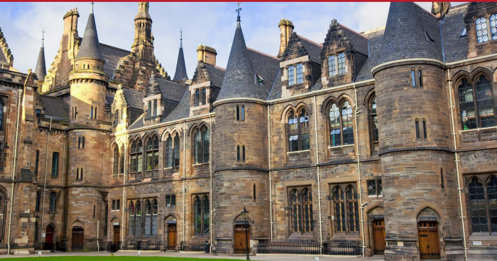
The University of Glasgow, Scotland, UK.

The University of Glasgow is a public research university in Glasgow, Scotland. Founded in 1451, it is the fourth-oldest university in the English-speaking world and one of Scotland's four ancient universities. The University Library is one of the oldest and largest libraries in Europe, with more than 3 million books and journals. Archives and Special Collections (ASC) is a part of University Services, and it has responsibility to collect and provide access to archival records, manuscripts, rare books and other primary and secondary sources to support teaching and research in the University of Glasgow and the wider community.