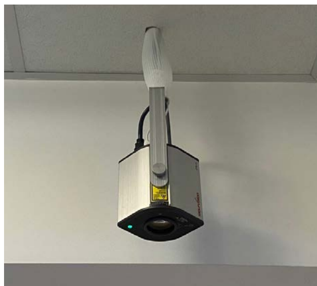
Ceiling-mounted WolfVision EYE-14, suspended above the working surface.

The capability to show articles 'live' on-screen during online classes, without compromising the quality of the displayed content helps to preserve the interactive and pedagogical approaches that are already in use during