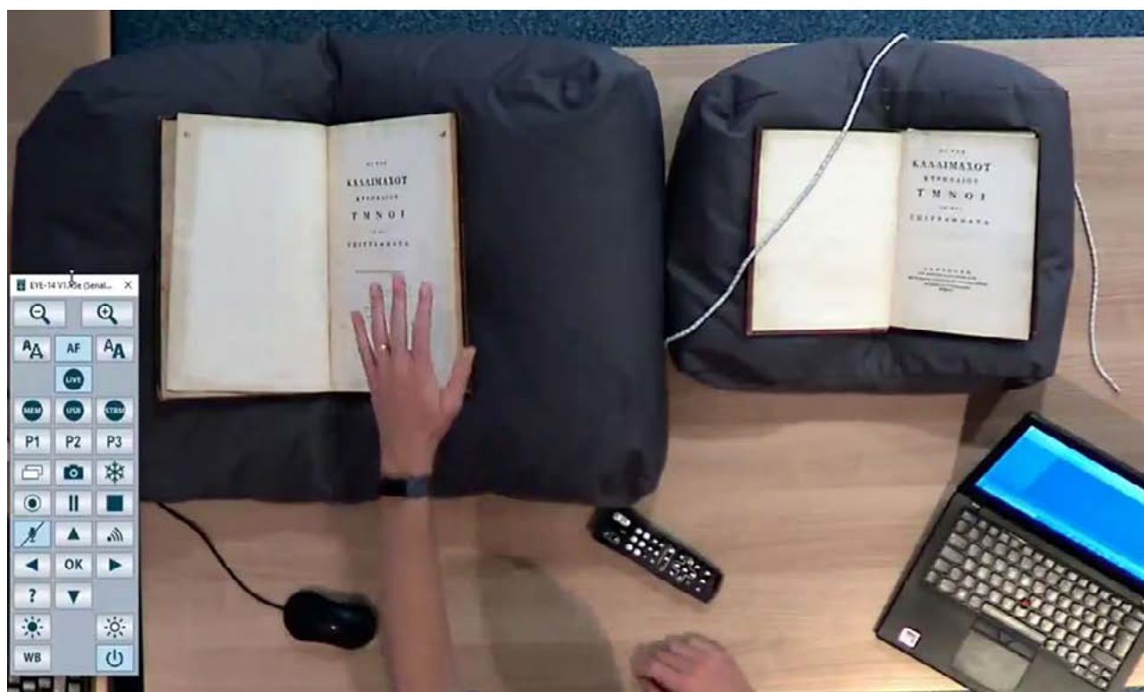
The ability to compare and move items around during Zoom sessions helps to replicate the in-classroom experience for remote students.