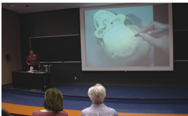
Ceiling Visualizers never block the view of the podium (see above). In the past, valuable seat room was used by bulky overhead projectors (see below) and finding a good view of the screen could cause disturbances in classrooms.