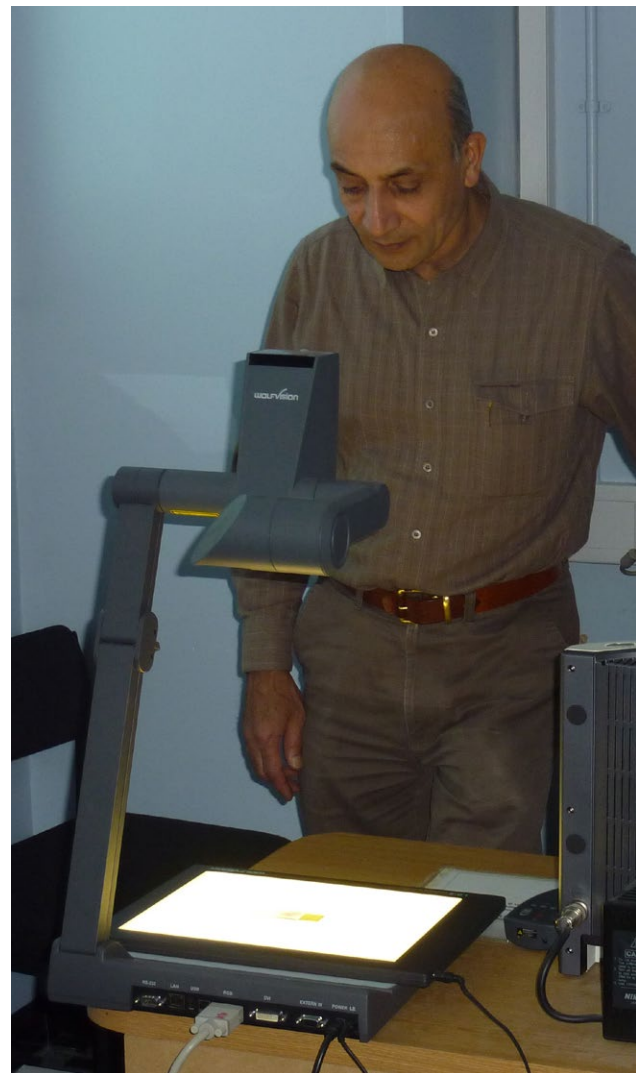
VZ-9plus 3 Visualizer in use at Charing Cross Hospital, London.