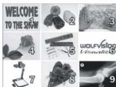
Example of a splitscreen