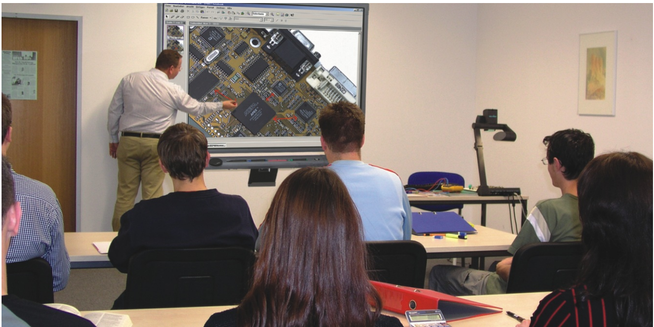
The Visualizer allows the presenter to display documents and 3-dimensional objects on the interactive whiteboard.

The interactive whiteboard turns your Visualizer and laptop into powerful tools for presentations and conferencing.