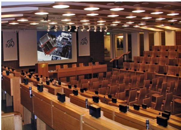
The Ceiling Visualizer produces clear pictures, visible from all seats of the Wallenberg hall

Having the laptop and Visualizer connected to the same display allows to switch easily between images from the two devices.